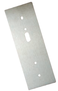
DK-26 Cover Plate